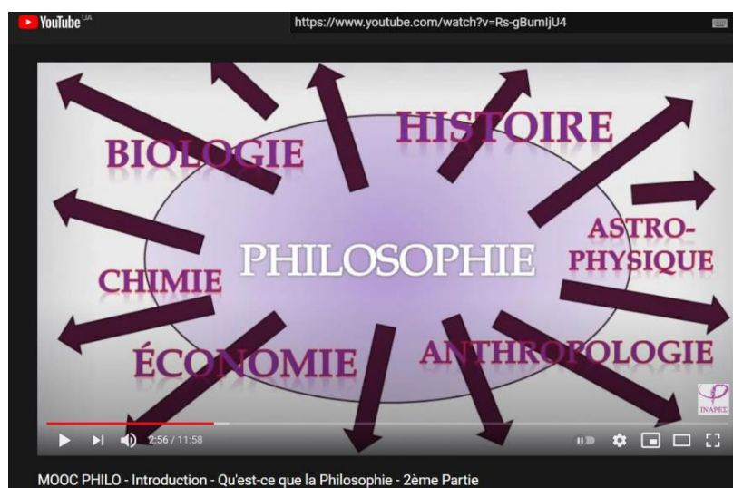
Fig. 3. Screen. Communication and interaction between philosophy and other sciences

On the training channel of the Aristotle Institute for Scientific Research (Institut Aristotélicien d'Etudes Scientifiques) MOOC PHILO there is a video "Introduction – Qu'est-ce que la Philosophie – 2ème Partie" (11 min 58) [35], revealing the connection and interaction between philosophy and other sciences.