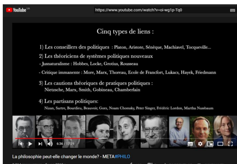
Fig. 4. Screen. Who do you think changed the world in philosophy?

The YouTube channel “ Sociologie de l'intégration ”, which has about 10 thousand subscribers, features a video “ Qu'est-ce que la philosophie? ” (12 min 35) [50], revealing the relationship between philosophy and other sciences that make up human knowledge. Directed by Jim Gabaret and Céline Marty, the channel aims to popularize main classical and contemporary philosophical studies as well as the humanities and social sciences; the channel is addressed to all those interested in philosophy. Our attention was drawn by the video “ La philosophie peut-elle changer le monde ” (17 min 29) [25], which examines what influence philosophers can have on the socio-political organization, customs and vision of their contemporaries' world; whether they should interact with the oligarchs in order to gain some transformative power; what is the role of the intellectuals in contemporary media and political space. The authors refer to the greatest philosophers' opinions (Sartre, Beauvoir, Nizan, Bourdieu, Marx, Nietzsche, etc.).